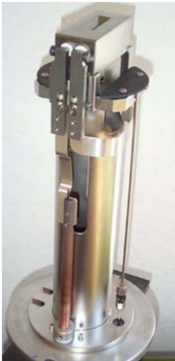
Ion Source with a Signet Bernas Arc Chamber installed.

VSEA – ION SOURCE Model 120 / 160 / 180 SERIES