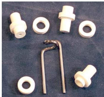
Signet's 1107 Filament Replacement Kit