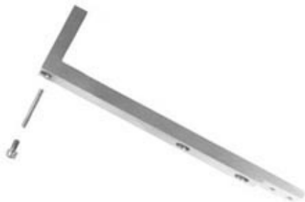
Signet Filament Post Design