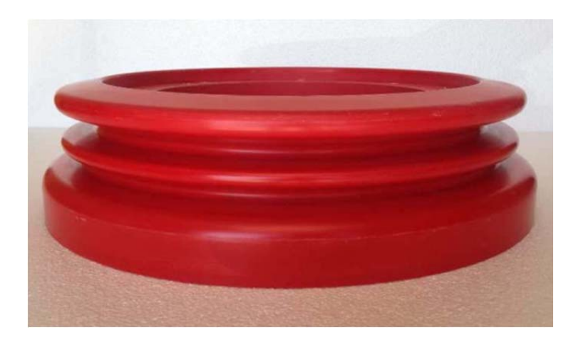
Signet 37-2559 Bushing for E500HP

Signet Products offers this replacement bushing for the VSEA E17125590. It is an enhanced design offering improved performance through both its configuration and the composite material used.