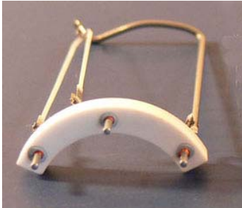
Signet Part Number 70-1068 Single 3" iridium hairpin filament with yttria coating