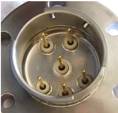
Connector base with gold plated pins and pin guard.

Applied Material PARTS Endura® 5500 PVD System