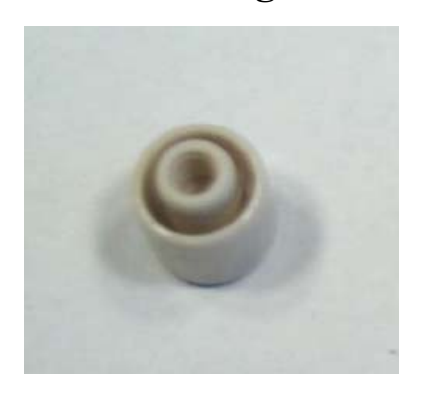
Signet Products Standoff 30-6042